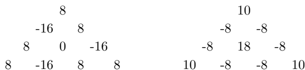
Figure 4: Trying to get symmetry

Solution. Seeking symmetry, we multiply both sides by six and write it as the sum in the following figure.